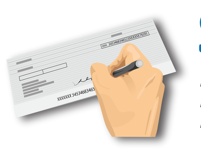
$5 per check payment process